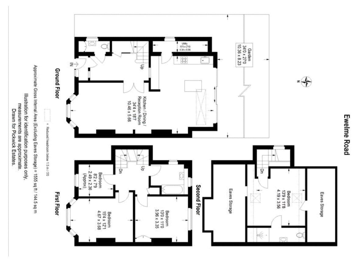
For Full EPC information, click \underline{\text{here}}